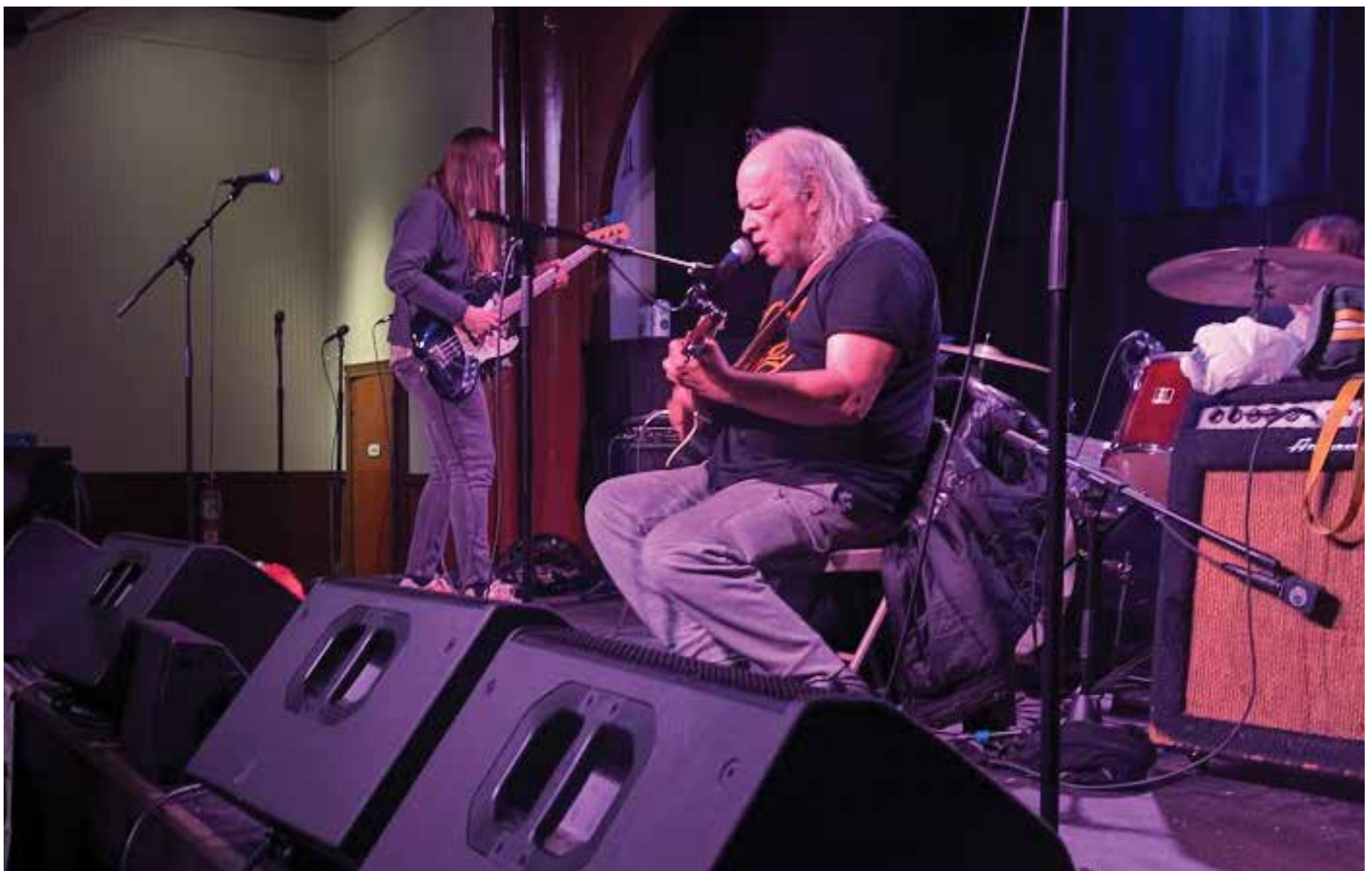
Voot Warning...Follies 2026