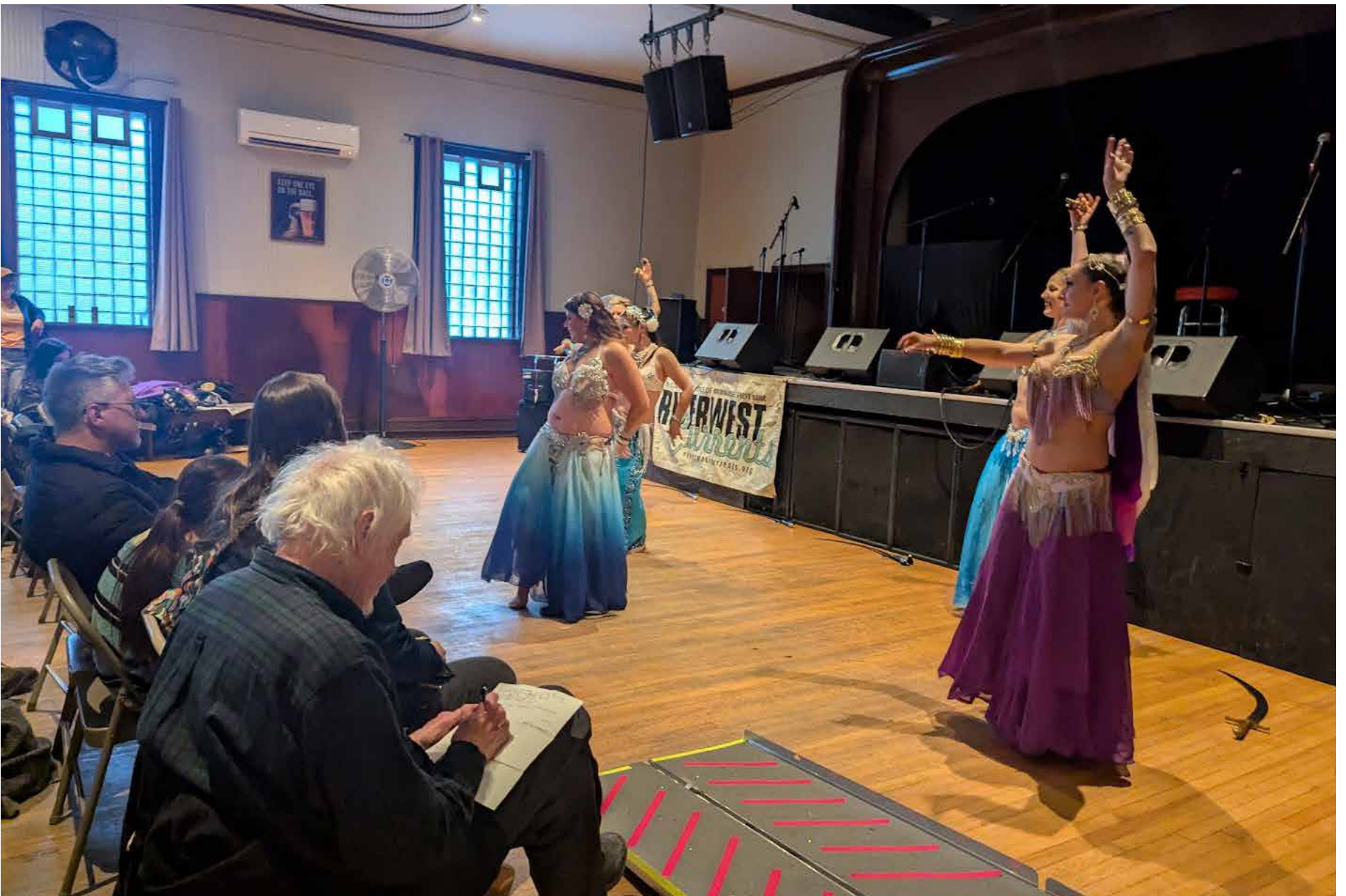
Tamarind Belly Dancers are always one of the favorites of the crowd. . And they were there for the first version of the Follies at the Falcon Bowl.