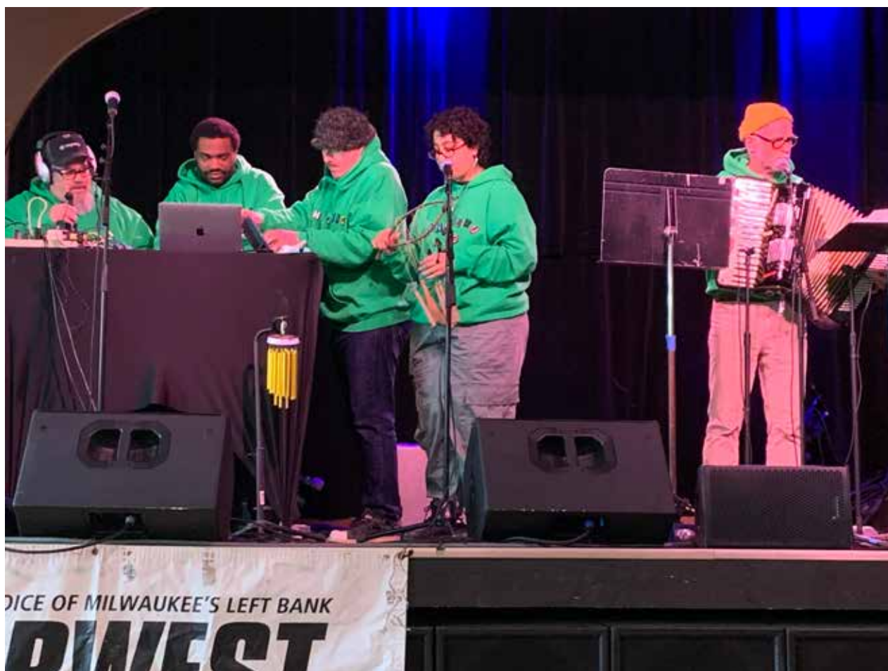
"Ching Suru" musical improv....Follies 2026