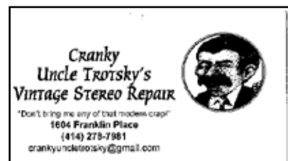
And he had a great sense of humor, and held annual parties.