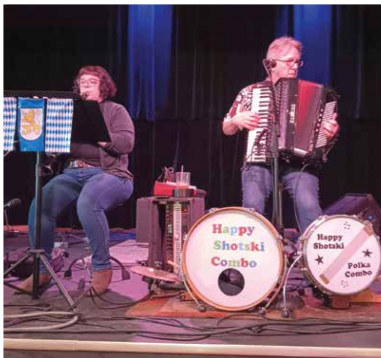
Happy Shotski Combo...Follies 2026 It ain't Milwaukee without a Polka band.