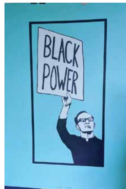
Just Seeds Poster: Created by Nicolas Lampert & Paul Kjelland, Milwaukee/Riverwest Artists

The 16th Street Viaduct, now renamed Caesar Chavez Drive, was seen as a line of division between white and black neighborhoods and was nicknamed the 'longest bridge in the world', a joke that has not aged well and leave little room for nuance. It was said to separate Poland from Africa.