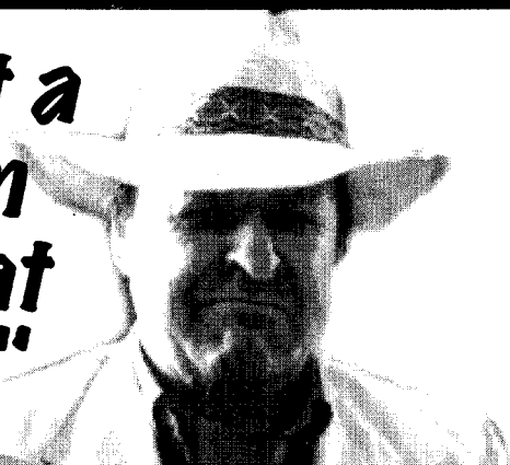
Yes, He was a social worker, and a good one.